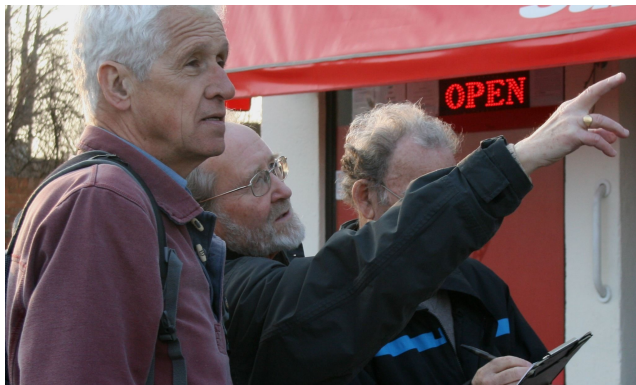
History Boffins surveying the street

partnership an Arts Project grant. We're incredibly grateful to the Council for this recognition of our continuing commitment to the Heavitree community.