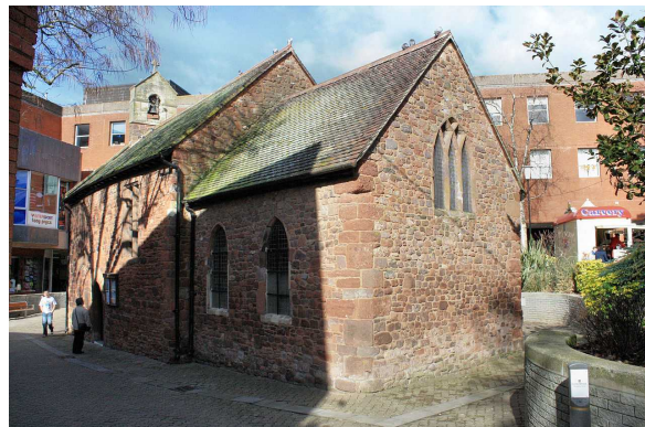
St Pancras Church, city centre

It's early days though so if you'd like to be involved in those discussions then now's the time to get in touch!