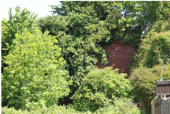
Heavitree Quarry – Coates Road

Did you know that stone quarried in Heavitree turns up in the City Wall, the Castle, the Underground Passages, a myriad of small Mediaeval chapels and dozens of linking walls and buildings all over the City?