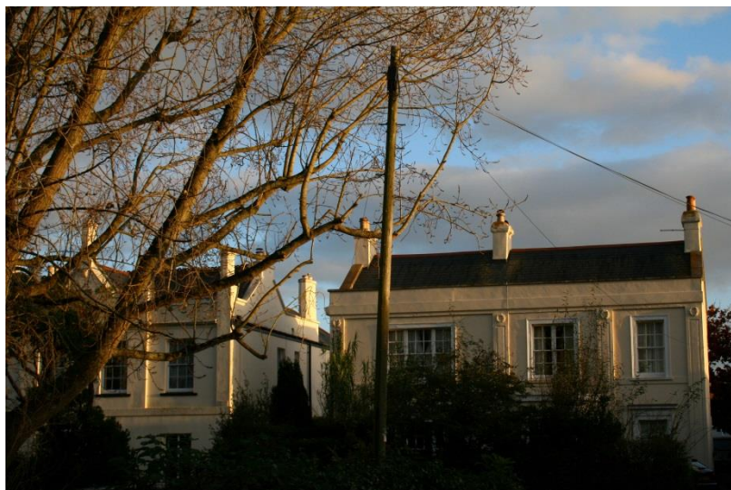
Bicton Place, Heavitree

You can also use the contact details below at any time to lodge your nomination or vote for an existing one. You're in charge!